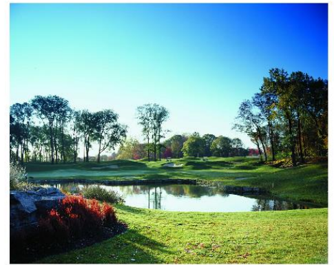
Whirlpool Golf Course

The Nestled The imposing Battlefield course is located on the north side of the Legends on the Niagara property. Golf Architect Douglas Carrick created a truly unique course that challenges every level of golfer. The Battlefield course features a nice mix of wide, links-style holes with generous undulating fairways, sand traps and greens that are bound by dense forest and brush.