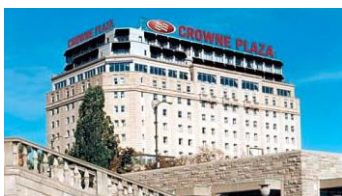
Crowne Plaza Niagara Falls