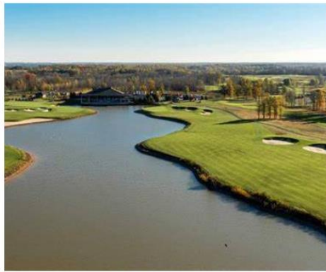
Niagara Legends Battlefield

Designed One of Golf Architects, Thomas McBroom's finest masterpieces. This challenging and break taking course features thick stands of deciduous trees, wetland hazards, knee-high fescue rough, and impeccable conditioning from tee to green. These all combine to make Ussher's Creek a classic parkland course.