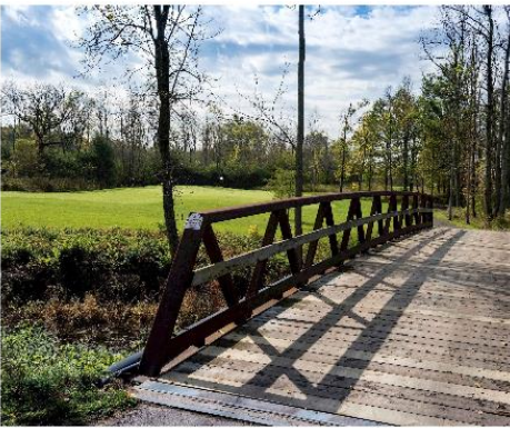
Niagara Legends Ussher's Creek

Designed One of Golf Architects, Thomas McBroom's finest masterpieces. This challenging and break taking course features thick stands of deciduous trees, wetland hazards, knee-high fescue rough, and impeccable conditioning from tee to green. These all combine to make Ussher's Creek a classic parkland course.